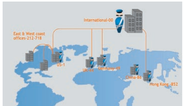
ECS multi-tiered hierarchical support and zone management

With ECS, network managers set policies, control network resources, implement authorization and authentication, deploy easy dial plans and bill CDRs.