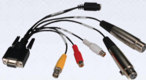
Input Breakout Cable